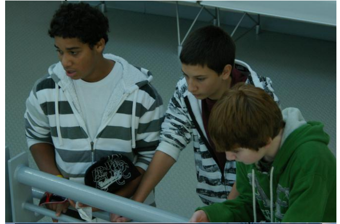
The National Museum of the Marine Corps

On the way home, students stopped for dinner in Harrisburg, PA and arrived home around 10:00 p.m. Next year's trip to Washington, D.C. is tentatively scheduled for November 2011.